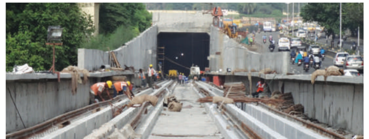
Cut and Cover work completed at Nanganallur Road to Airport Viaduct