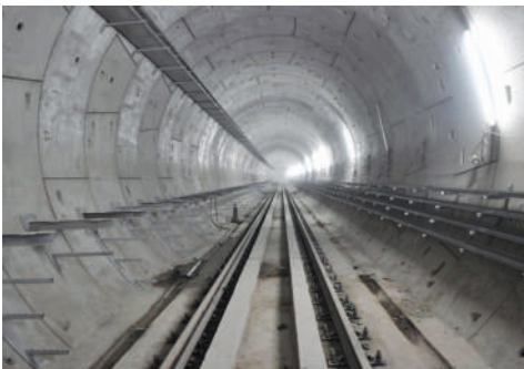
Finished track slab at tunnel between Thirumangalam to Anna Nagar

Track work completed for entire depot length of 14606m and 41 numbers of turnouts were laid.