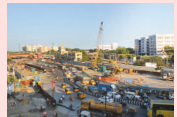
Work in progress at Central Metro