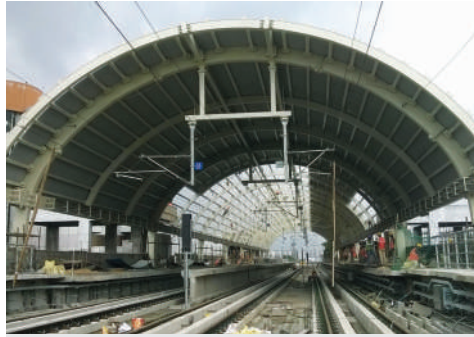
Little Mount Station