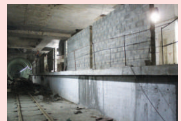
Work in progress at Egmore Metro