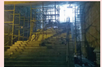
Work in progress at Anna Nagar East Station