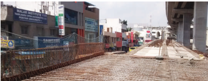
Deck slab preparation is in progress at Vadapalani Flyover