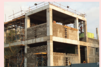
Ancillary building work in progress at Nehru Park Station