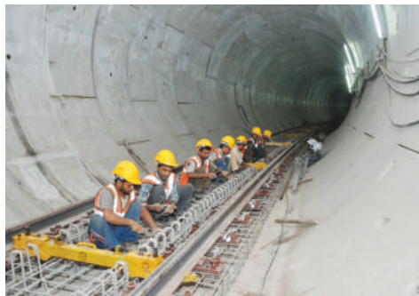
Slab Reinforcement work in progress at tunnel section