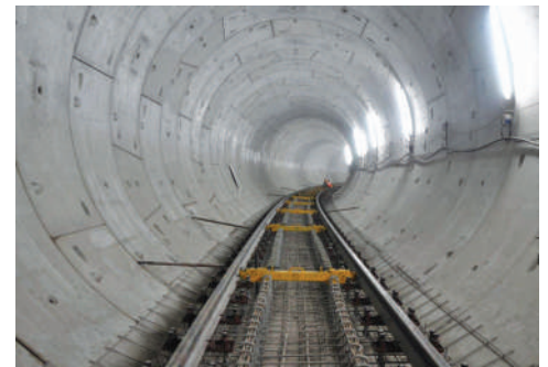
Track alignment made ready for slab concrete in tunnel