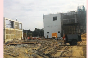
Ancillary Building work in progress at Shenoy Nagar Station