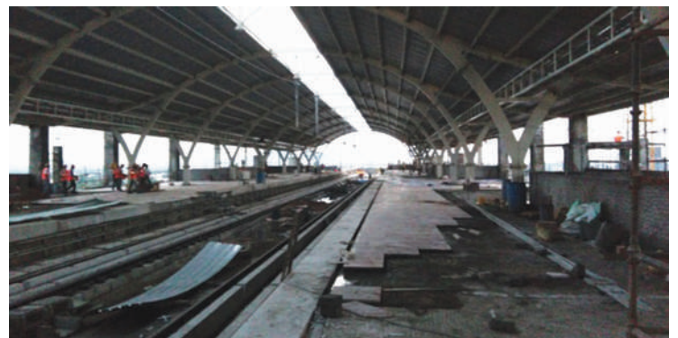
St. Thomas Mount Station