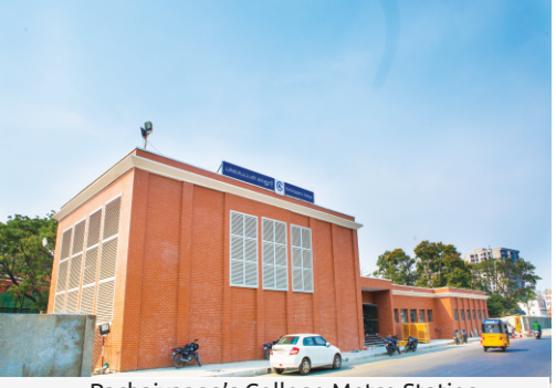
Pachaiyappa's College Metro Station