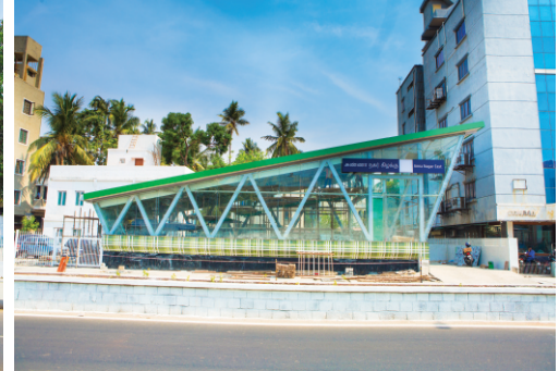
Anna Nagar East Metro Station