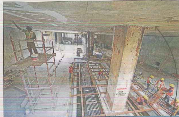
OTHER DESIGN CHANGES