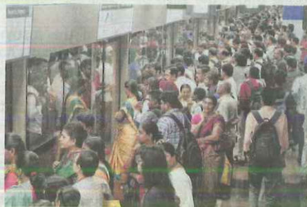
Most travellers take the Metro to get to their workplaces, followed by those leaving town by train or flight. ■ FILE PHOTO

*The first service is at 4.30 a.m. and the last one is at 11.00 p.m. ● Share of riders in October