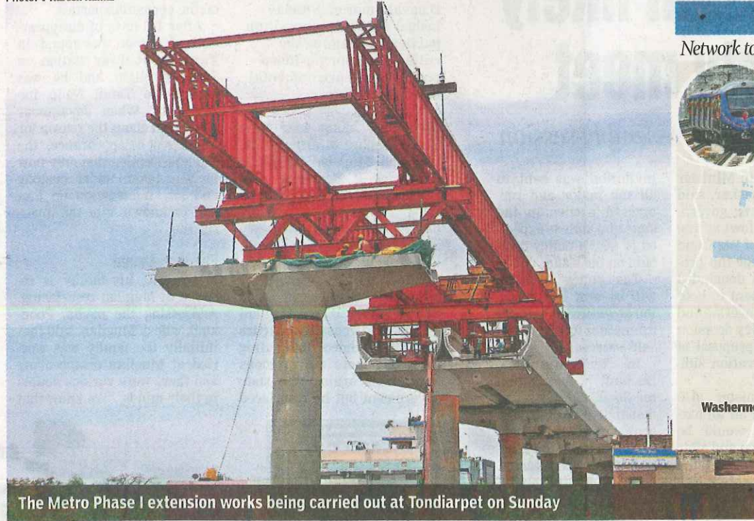
The Metro Phase I extension works being carried out at Tondiarpet on Sunday

said they had taken up work on the construction of two underground stations and track laying work.