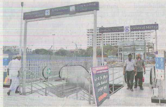
The subway will help commuters move from Chennai Central Metro station to Pallavan Salai.

Minor construction work continues at Chennai Central Metro station, and officials say this will be completed soon.