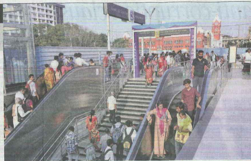
Well on track: A view of the Chennai Central Metro station; right, workers cheering after the inauguration of the Chennai Central to Washermanpet stretch.