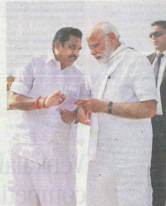
Another phase: Chief Minister has asked the PM to direct the Ministry of Housing and Urban Affairs to sanction Phase II as was done for Phase I.

Out of the total project cost of ₹69,180 crore, the land cost and State taxes amounting to ₹13,723 crore would be met by the State