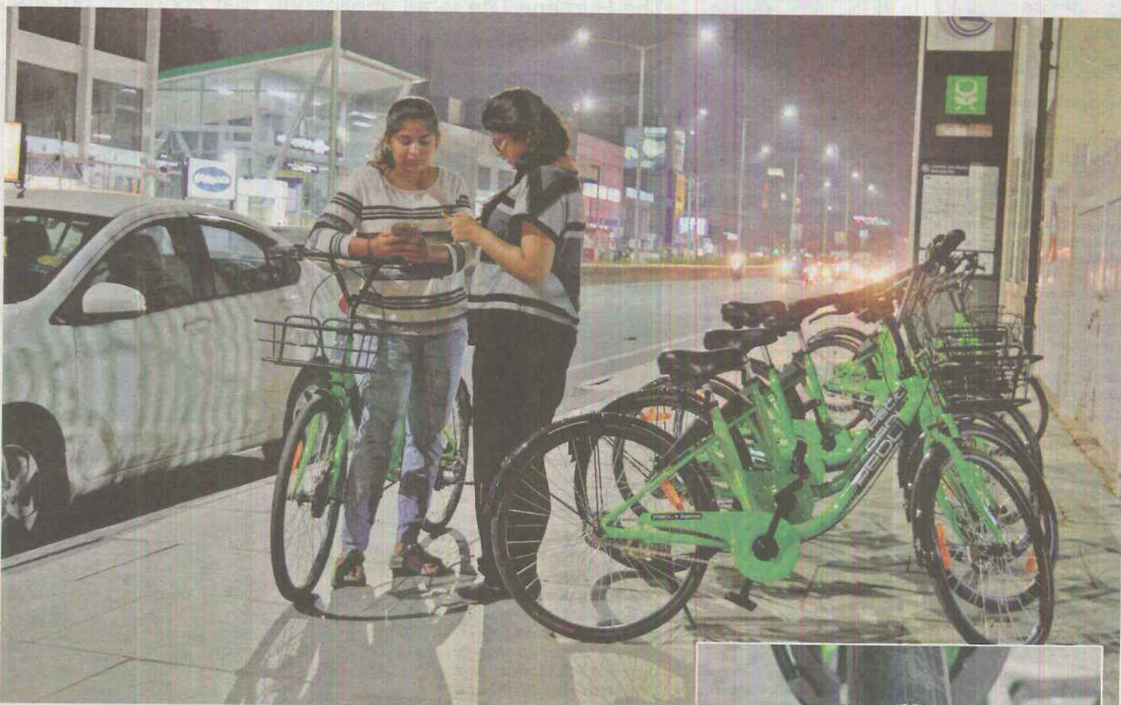
The cycles are placed at three metro stations.