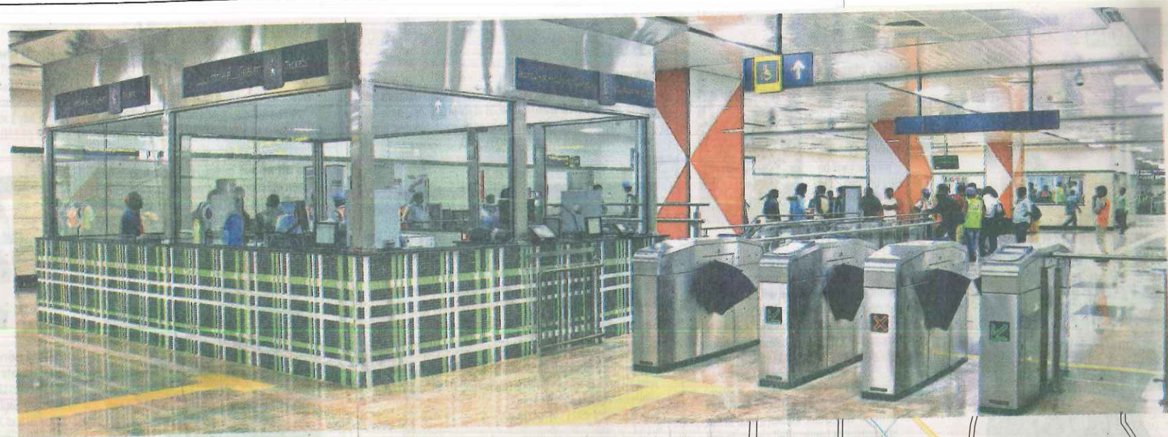
Photo of Thirumangalam metro station for representation