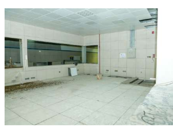
Work in progress at Saidapet Metro Station