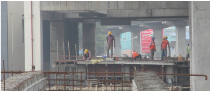
Work in progress at Vadapalani Flyover