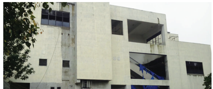
Work in progress at Little Mount Station