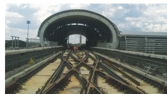
Diamond cross over track work completed at Airport station