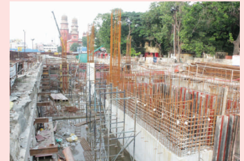
Work in progress at High Court Station