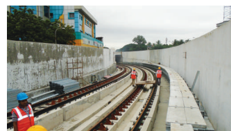
Track work completed at Thirumangalam ramp

Depot : Track work completed for entire depot length of 14606m and 41 numbers of turnouts were laid.