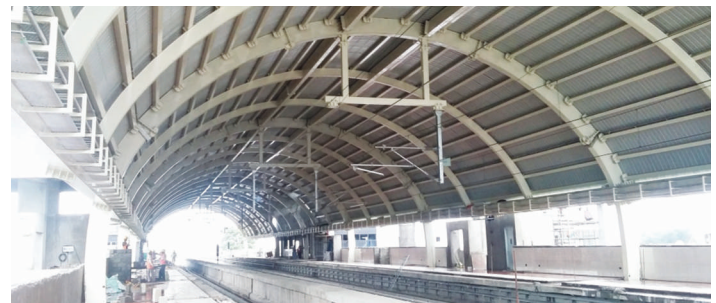
Little Mount Station