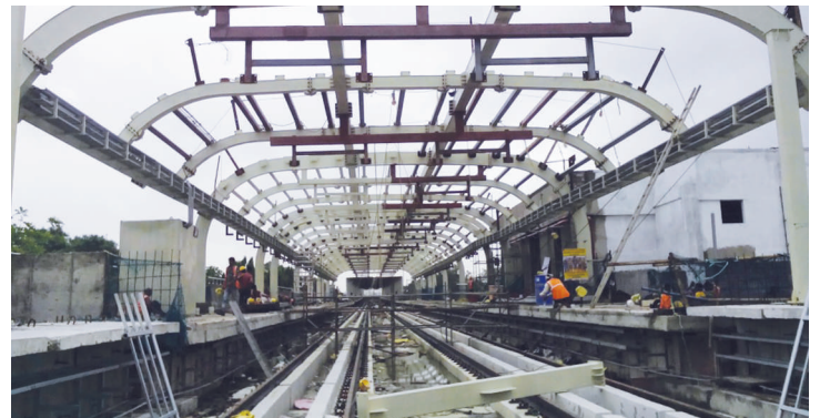
Work in progress at Nanganallur Road Metro Station