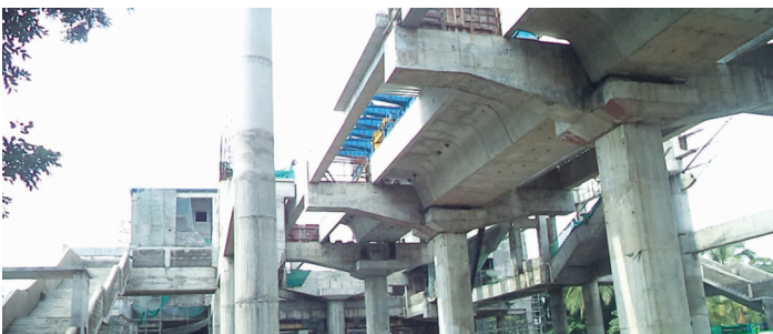
Work in progress at Meenambakkam towards Airport Viaduct