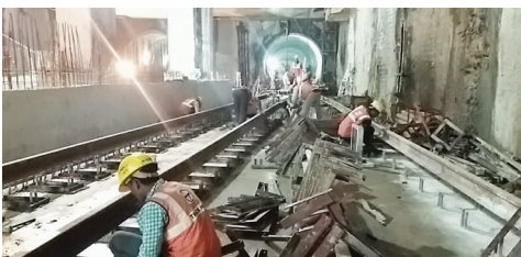
Diamond crossing grouting work in progress at Shenoy Nagar Metro Station