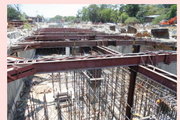
Work in progress at Shenoy Nagar Station