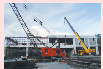
Work in progress at Anna Nagar East Station