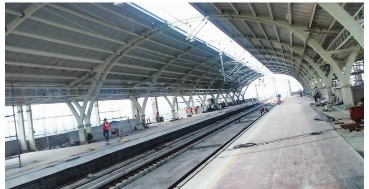
Work in progress at St Thomas Mount Metro Station