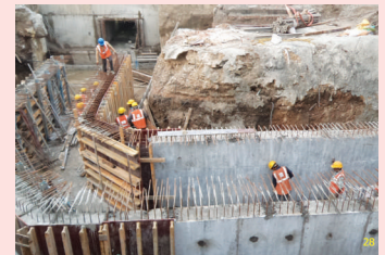
Utility gallery rebar work in progress at Nehru Park Station