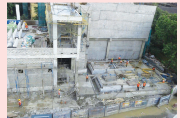
Ancillary building DG area work in progress at Pachaiyappa's Station