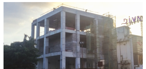
Work in progress at Anna Nagar Tower Station