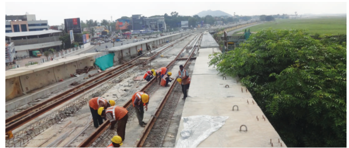
Work in progress from Nanganallur Road to Airport