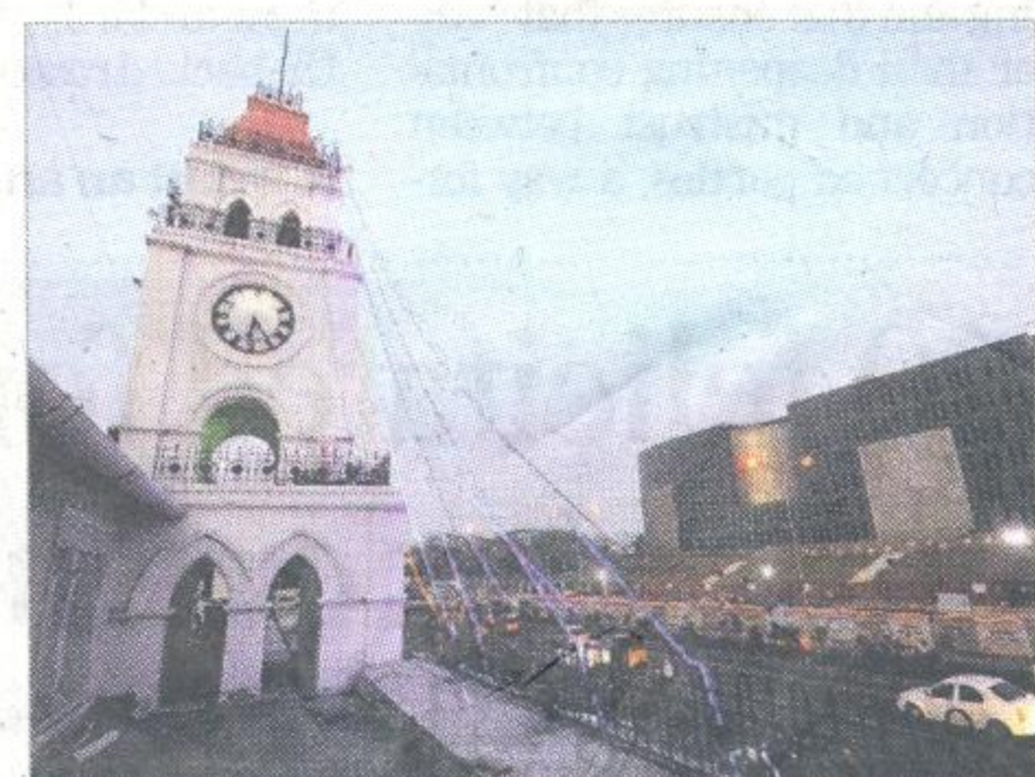
The entrances for the Government Estate station will be near the P Orr & Sons and India Silk House

lation shafts, power backup, fire safety equipment and electrical sub-stations near the underground stations. "We have tried to acquire government land to house the utility structures to avoid the hassles of procuring private property," said the official. Apart from state government land in Saidapet and near Anna flyover, CMRL has got