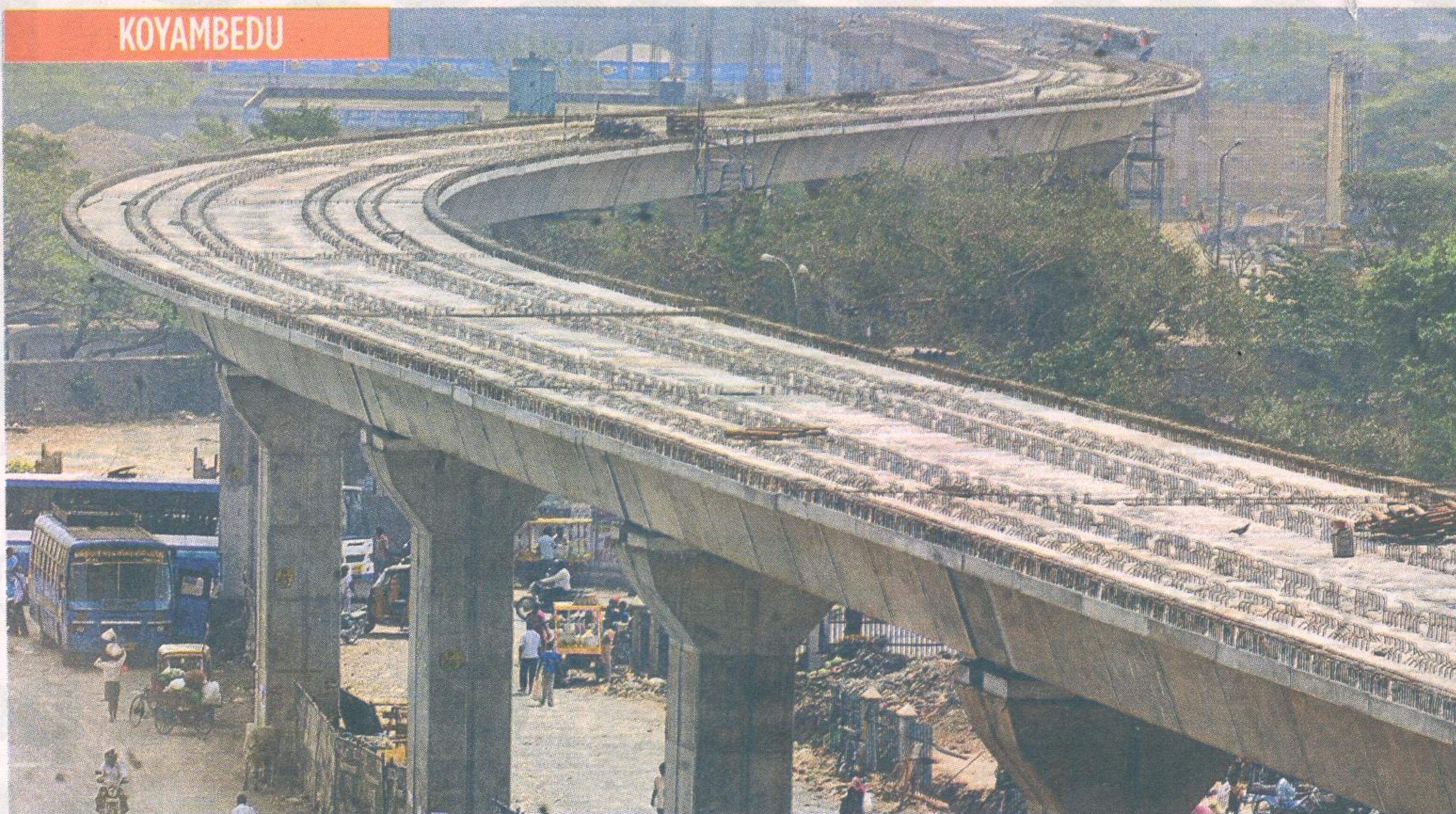
The almost finished elevated metro rail track near Koyambedu market is a pointer to the speed at which the work is progressing.