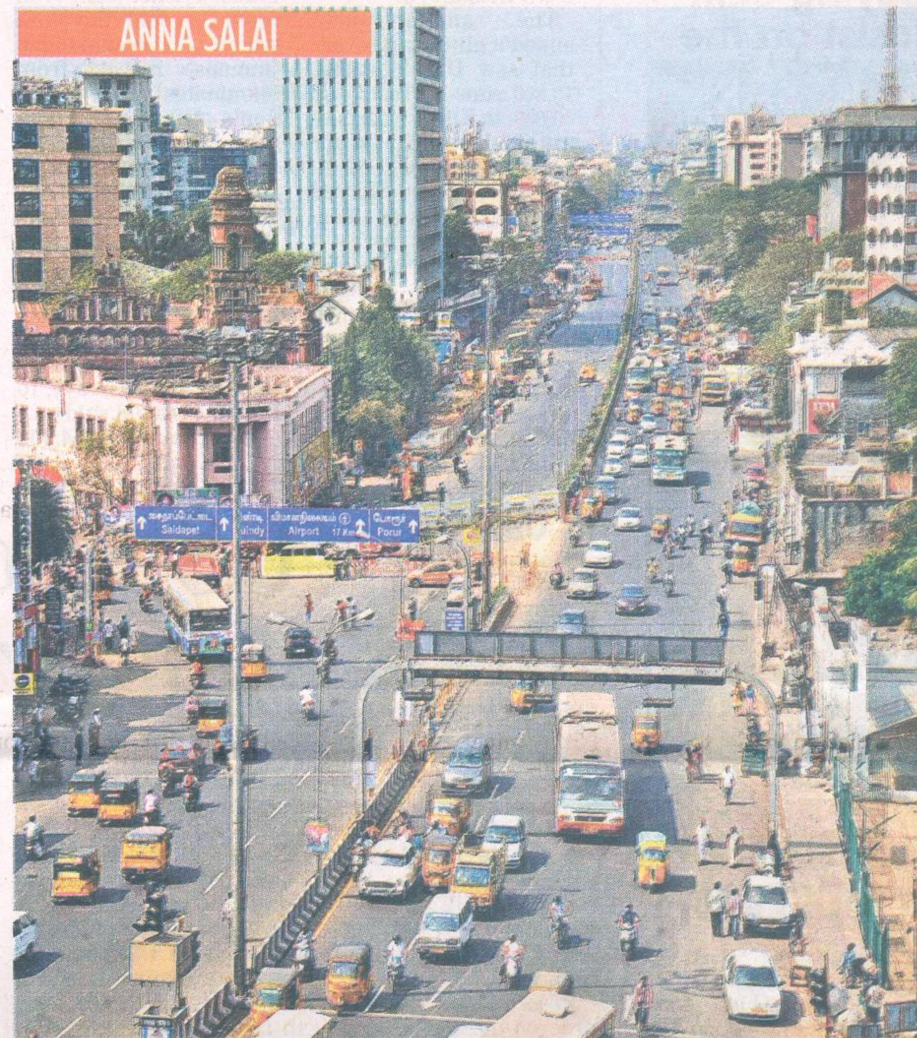
The arterial Anna Salai is free from traffic chaos after the recent traffic diversions. However, there are a few complaints from local residents due to one way traffic.