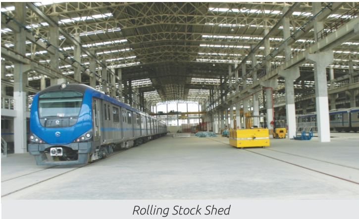
Rolling Stock Shed