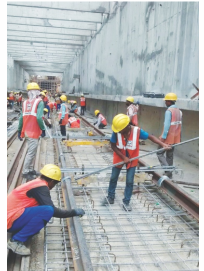
Meenambakkam Cut & Cover Ramp

Track work completed for entire depot length of 14606m and 41 numbers of turnouts were laid.