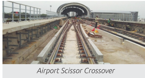
Airport Scissor Crossover

In Elevated section between saidapet ramp and airport, 13667m plinth concrete completed out of 18723m and 19 turnouts were laid out of 23 turnouts and balance work in progress. Casting of scissor cross over at Airport has been completed.