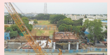
Work in progress at Anna Nagar Station