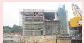
Work in progress at Shenoy Nage Station