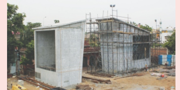
Work in progress at Washermenpet Station