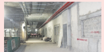
Work in progress at High Court Station