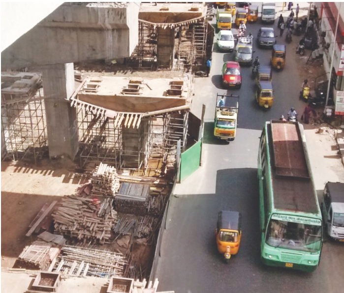
Vadapalani Flyover work -Piercap & Pedestal construcion in progress