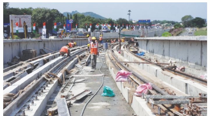
Cut and Cover work in progress from OTA to Airport Viaduct