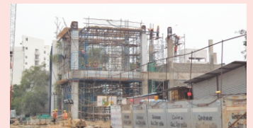
Work in progress at Nehru Park Station