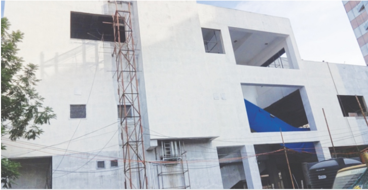
Little Mount Station