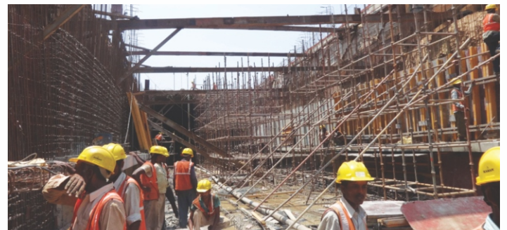
Cut and Cover work in progress from OTA to Airport Viaduct