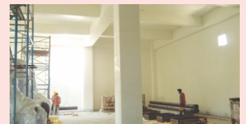
Work in progress at Kilpauk Station