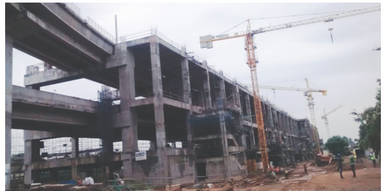
St. Thomas Mount Station