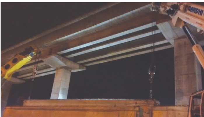
I-Girder erection work in progress at Vadapalani Flyover