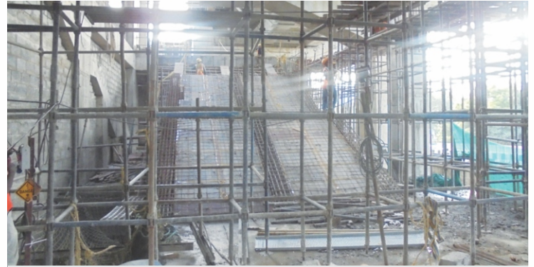
Guindy Metro Station